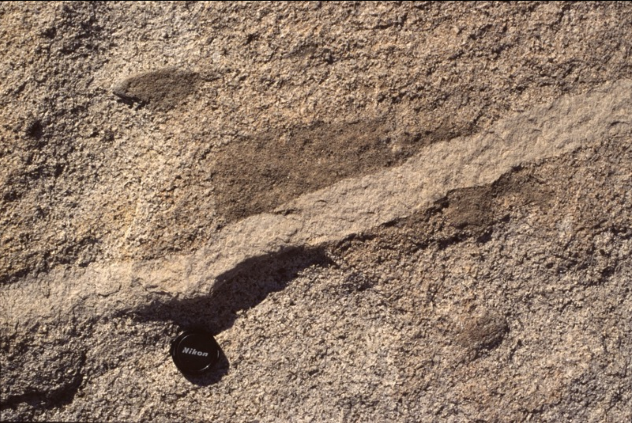
Inclusion and cross-cutting relationships