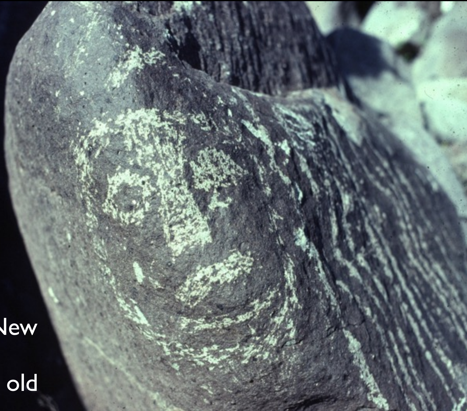
Petroglyph, New Mexico ~9,000 years old