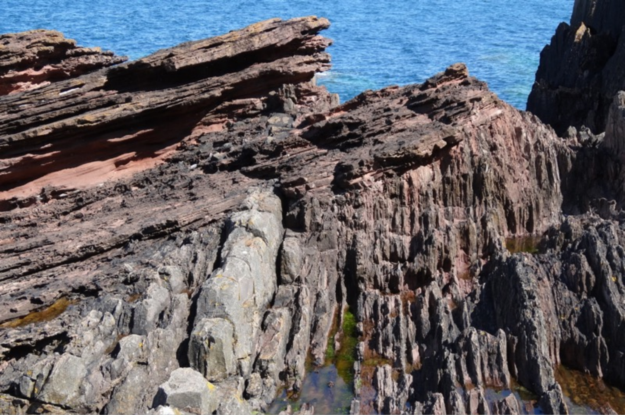
Siccar Point, Scotland