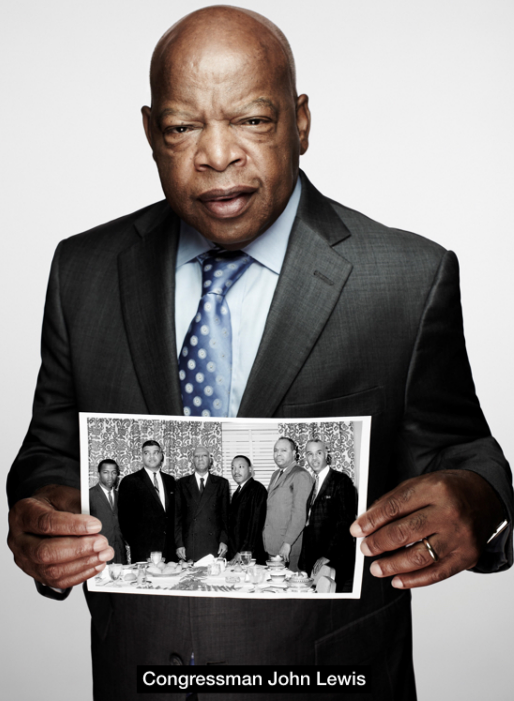
Congressman John Lewis